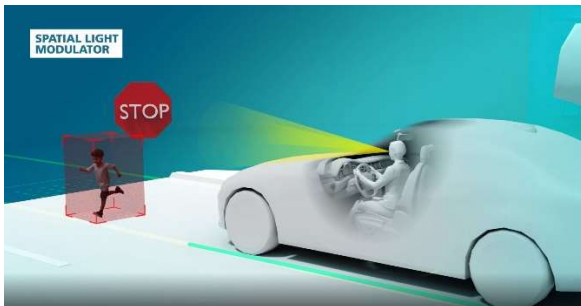
Innovative micromirror arrays from Fraunhofer IPMS enable a safe driving experience thanks to realistic holography