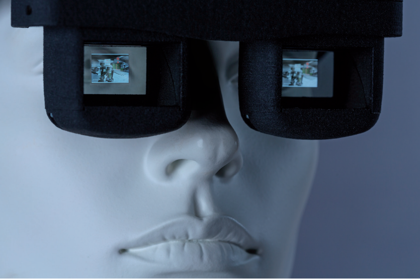
Interactive data eye glasses with bidirectional OLED microdisplay