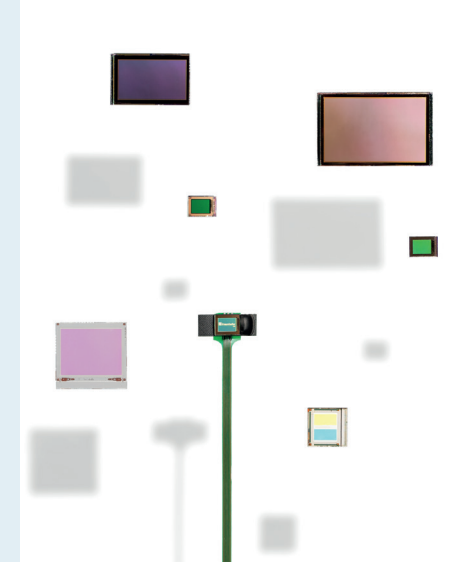
Various OLED microdisplays of Fraunhofer IPMS