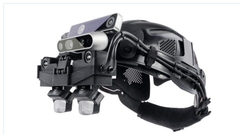
Novel AR assistance system for industrial use

Information displays and conventional video displays. Most industrial use cases require focused information rather than a running video stream. Furthermore other parameters play an important role such as ergonomics, compactness and a battery runtime of more than one shift for the complete system. Augmented Reality (AR) in industrial applications is often used for real-time overlay of design data or assistance scenarios.