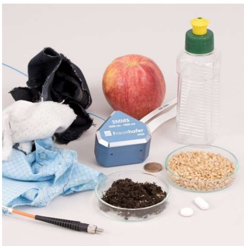
Selection of possible measurement samples from the SMMS platform of Fraunhofer IPMS